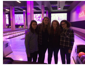
Maronteens/Crossroads Bowling event after Sunday Mass. St. Sharbel's Youth Rock!