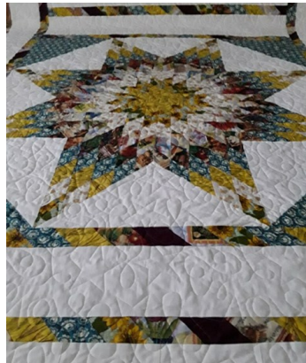
Star of Bethlehem Raffle Quilt Tickets $1.00 each or 6 for $5.00