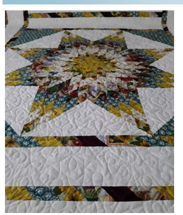
Star of Bethlehem Raffle Quilt Tickets $1.00 each or 6 for $5.00