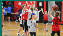
FALL HOT SHOTS